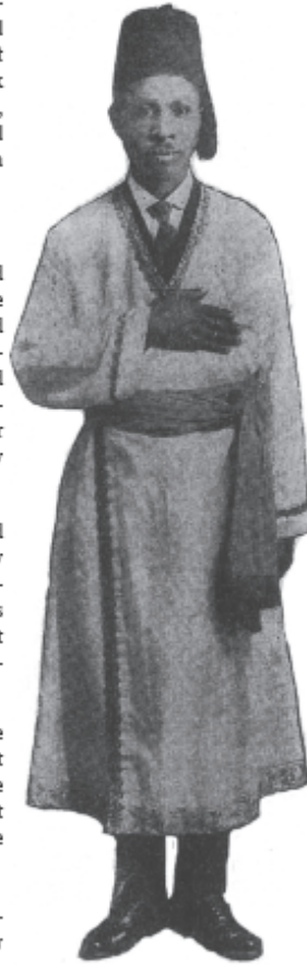
Prophet Noble Drew Ali

Act 5 - No organization of Moorish America is to cause any confusion or to overthrow the Laws and Constitution of the said Government but to obey hereby.